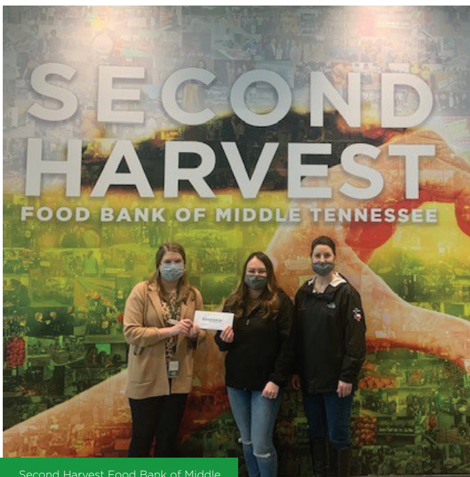
Second Harvest Food Bank of Middle Tennessee Emergency Grant recipient.